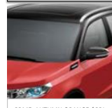
PRME. AUTUMN ORANGE / PRL.