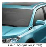
PRME. TORQUE BLUE (ZTG)