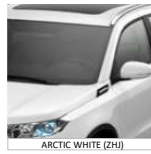
ARCTIC WHITE (ZHJ)