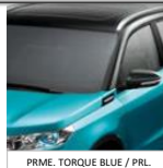
PRME. TORQUE BLUE / PRL. MIDNIGHT BLACK