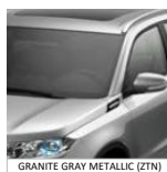
GRANITE GRAY METALLIC (ZTN)