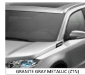
GRANITE GRAY METALLIC (ZTN)