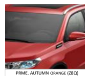
PRME. AUTUMN ORANGE (ZBQ)