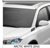
ARCTIC WHITE (ZHJ)