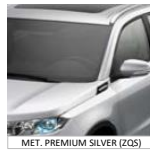
MET. PREMIUM SILVER (ZQS)