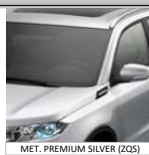
MET. PREMIUM SILVER (ZQS)