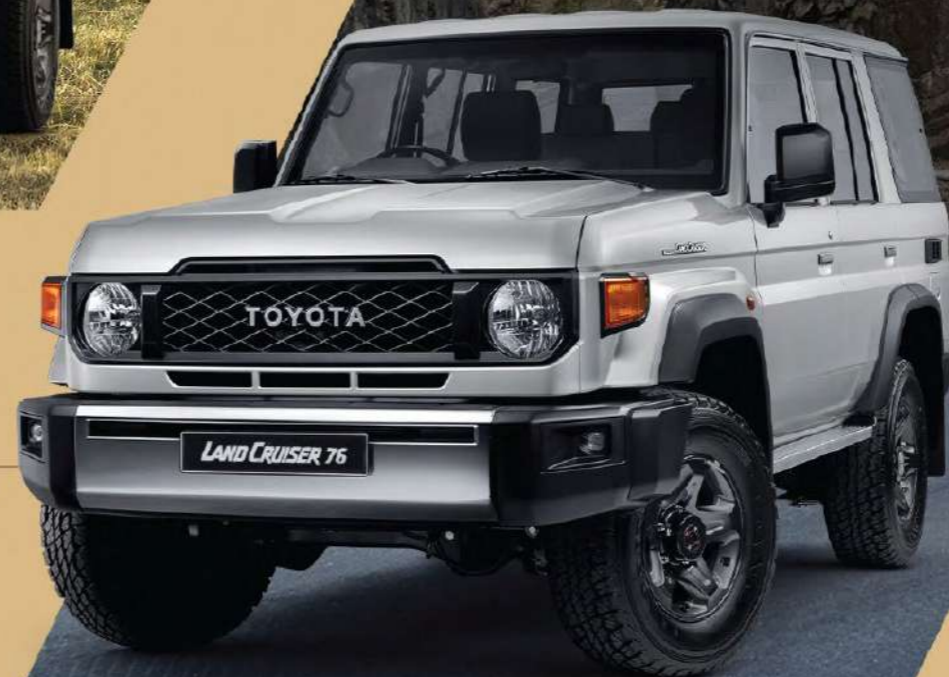
LAND CRUISER 76

MODEL SHOWN: Land Cruiser 79 2.8 Double Cab AT Diesel