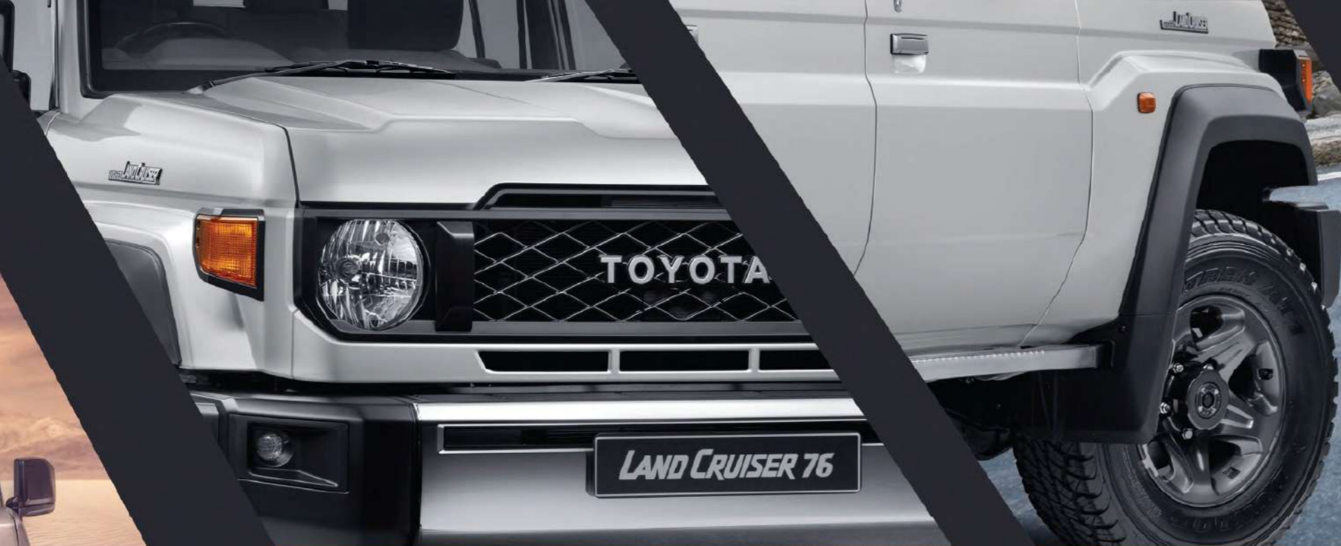
Rugged grille with plated bumper