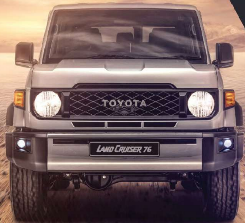
MODELS SHOWN: Land Cruiser 76 2.8 GD-6 SW LX Diesel