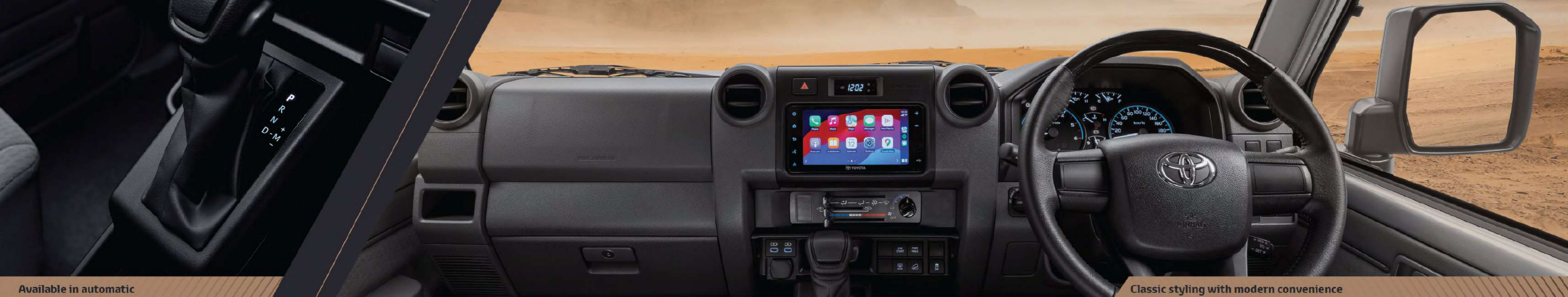
Available in automatic