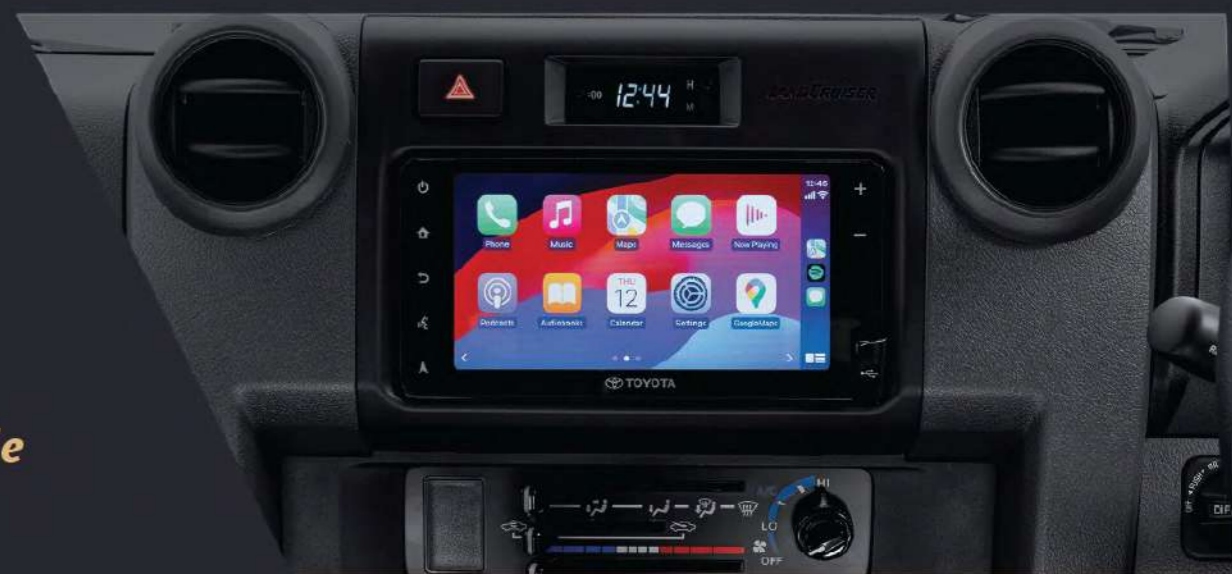
Touch-screen infotainment system

The Land Cruiser 70 Series' interior maintains its classic style while adding convenience to match the modern world.