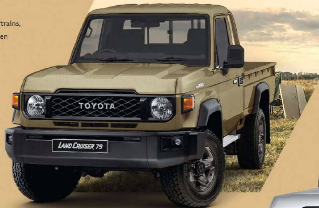
LAND CRUISER 79

Land Cruiser 79 2.8 Single Cab AT Diesel