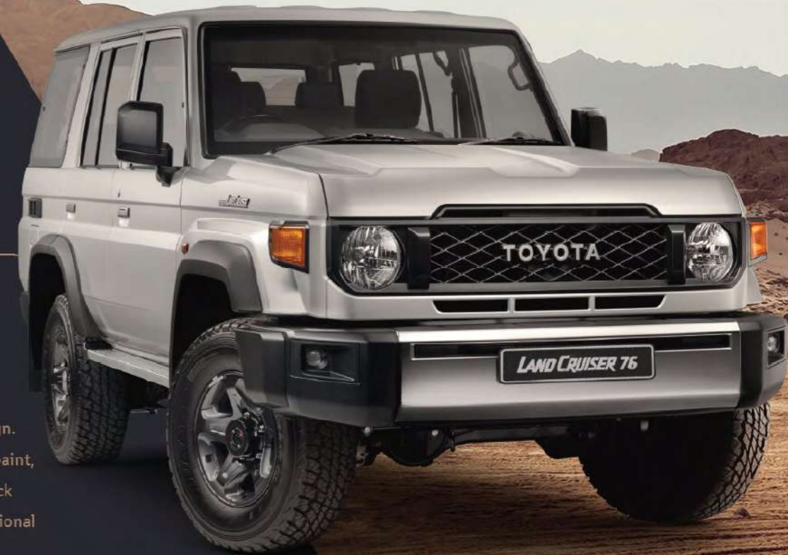
MODEL SHOWN: Land Cruiser 76 2.8 GD-6 SW LX Diesel