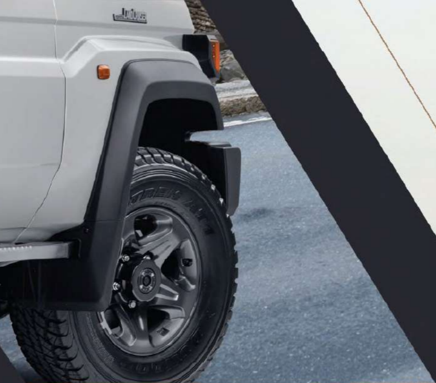
16" aluminium wheels