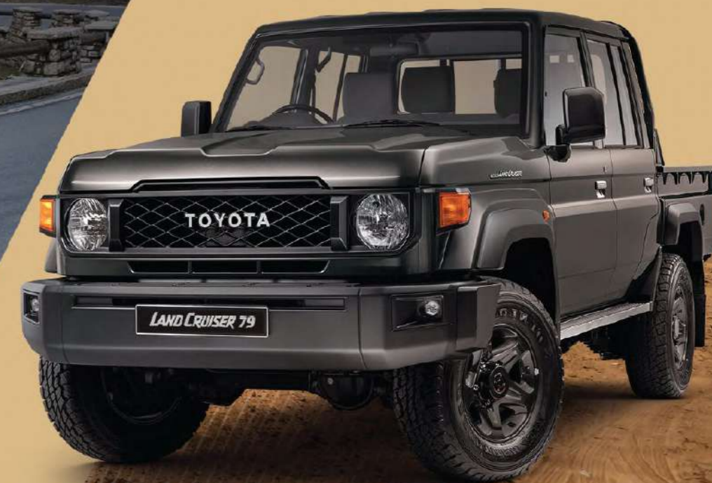
LAND CRUISER 79

Land Cruiser 79 2.8 Double Cab AT Diesel