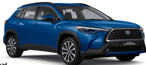
8X2 - Nebula Blue ME.